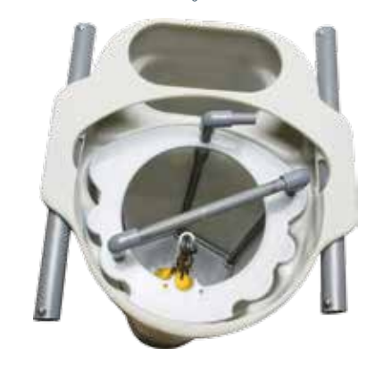
The ECO FILTER features a dual compartment design housing which can be used for your simplex or duplex application needs.