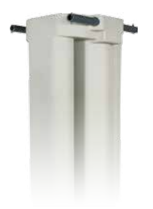
Rotational molded polyethylene housing with UV inhibitors for durability and shelf life.

The Delta Treatment Systems ECO FILTER draws effluent from the middle layer of your septic tank. This area is considered the "clear zone" of a septic tank. In a properly functioning septic tank, gross solids will settle to the bottom of the tank and grease and scum will rise to the top of the tank's water level, creating this "clear zone". Septic effluent from this zone enters the ECO FILTER, where the remaining unwanted solids are filtered from the pump system. The unit is designed to maximize the surface area of the filter to prolong the filter's life, providing you the ideal solution for your wastewater needs.